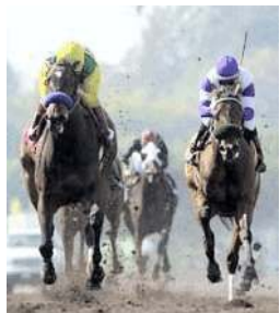
Composure (left) bests Elloluv

Trainer Bob Baffert has Composure (Touch Gold) under consideration for the GI Kentucky Derby and the Lewis colorbearer did her part yesterday, getting by a game Elloluv (Gilded Time) to win the GI Santa Anita Oaks. The Triple Crown nominee had a troubled trip last out, but still managed to deny Elloluv by a neck in the GI Las Virgenes S. Feb. 9 and was odds-on to repeat that effort. Off a step slowly, the big bay ranged up three wide on the backstretch as Elloluv dictated the pace, drew even on the far turn and outslugged her rival down the lane. "This wasn't particularly her kind of race, having to come from off a very slow pace," explained winning rider Jerry Bailey. "But when the other filly picked it up, my horse found another gear."