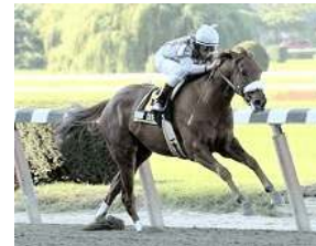
Funny Cide at Belmont