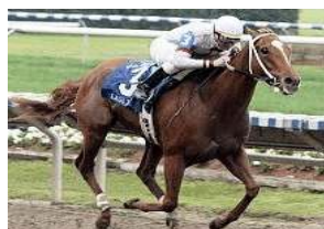
Lady Tak

A Hill 'n' Dale exacta in the Fair Grounds Oaks The extraordinary LADY TAK (by Mutakddim) maintains her immaculate record, defeating the sensational multiple graded-stakes winning ATLANTIC OCEAN (by Stormy Atlantic) in the $350,000 Fair Grounds Oaks (G2) www.hillndale.net