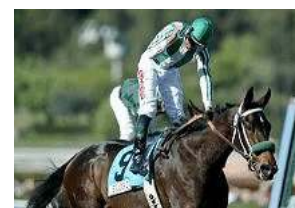
Atlantic Ocean Benoit

A Hill 'n' Dale exacta in the Fair Grounds Oaks The extraordinary LADY TAK (by Mutakddim) maintains her immaculate record, defeating the sensational multiple graded-stakes winning ATLANTIC OCEAN (by Stormy Atlantic) in the $350,000 Fair Grounds Oaks (G2) www.hillndale.net