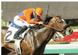
Atswhatimtalknabout