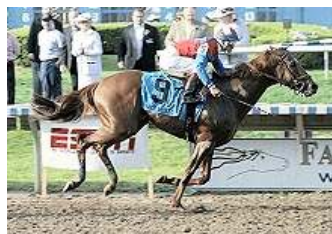
Peace Rules

Peace Rules (Jules), sent off a 9-1 outsider, tracked pacesetter Funny Cide (Distorted Humor) through six furlongs in 1:10.60, drove inside 6-5 choice Badge of Silver (Silver Deputy) as they raced down the lane and drew off to win the GII Louisiana Derby by 2 1/4 lengths.