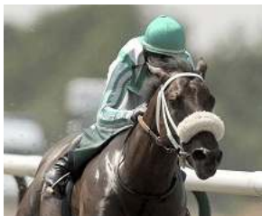
Elusive City