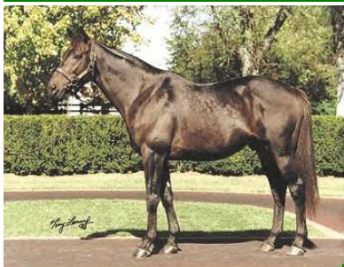
By Roberto, out of Andover Way