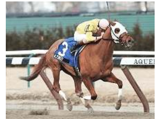
AlyswEEP