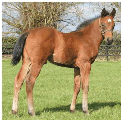
▲ c. ex Abla