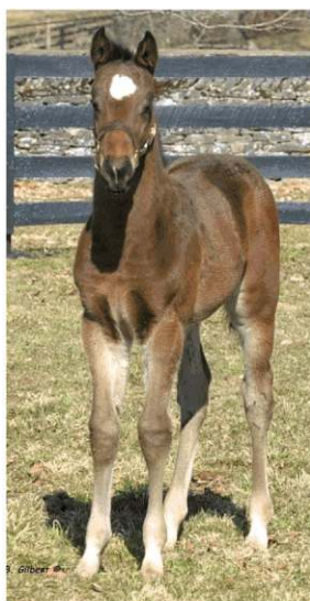
◀ f. ex Lyric Theatre