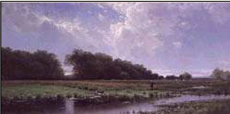
Click here to enlarge image.

All horses in the TDN are bred in North America, unless otherwise indicated