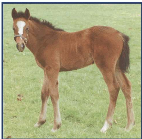
f. ex SOHA (AT 4 WEEKS). Her half sister realised 400,000Gns last year.