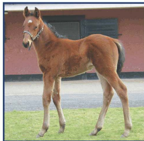
c. ex Epsom Oaks - Gr.1 winner LOVE DIVINE (AT 3 WEEKS).

A brilliant Epsom Derby winner by sire of sires SADLER'S WELLS . Out of 'Arc' winner URBAN SEA .