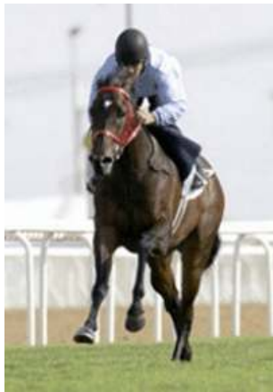
Ipi Tombe in Dubai

Ipi Tombe (Zim) (Manshood {GB}), who is undefeated in two starts in Dubai, turned in an impressive 800-meter work Monday as she prepares for Saturday's $2-million G1 Dubai Duty Free at Nad al Sheba. The South African-trained mare, who completed her task in :48.13, zipped through the final 400 meters in :22.72, easily better than her stablemate Victory Moon (SAf) (Al Mufti), who galloped earlier in the day. U.A.E Derby entrant Victory Moon , who ran second to Inamorato in the Mar. 8 Al Bastikya last time out, covered a half mile in :48.4, with a final quarter in :23.61.