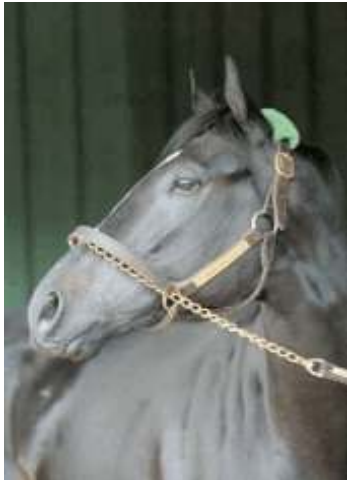
War Emblem

War Emblem (Our Emblem--Sweetest Lady, by Lord at War {Arg}), who won the Kentucky Derby and