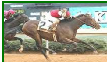
Crowned King

CROWNED KING, by BARKERVILLE , wins the $125,000 Rebel S. at Oaklawn Park Saturday by 1 1/4 lengths! The 3-year-old was bred by Wafare Farm.