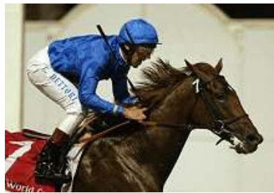
Moon shines brightly over Dubai

Moon Ballad (Ire) , a son of 1997 Dubai World Cup winner Singspiel (Ire), assumed command after the opening three furlongs and left no question as to who was best on this day, charging to an easy five-length victory over a game