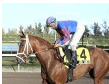
Lion Tamer

Trainer Todd Pletcher is keeping all of his options open with star pupil Lion Tamer (Will's Way) and has nominated the Michael Tabor-owned chestnut to a trio of Aqueduct fixtures Apr. 12; the GI Wood Memorial and the GIII Bay Shore S. against sophomores, and to the GI Carter H. for three-year-olds and up. But the colt