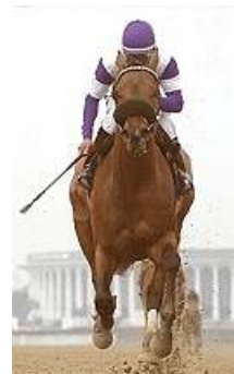
Elloluv