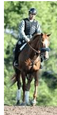
Ocean Terrace