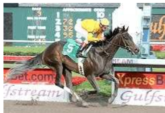
Yell Wins Davona Dale

Yell (A.P. Indy) became the fourth graded-stakes winner out of Wild Applause (Northern Dancer) when she galloped to a six-length win over Ivanavinalot (West Acre) in the GII Davona Dale S. at Gulfstream Park. She will try to give mom a second Grade I winner (following the example of older brother Eastern Echo) in today's GI