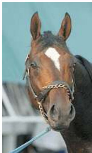
Empire Maker

Empire Maker (Unbridled), dominant winner of the GI