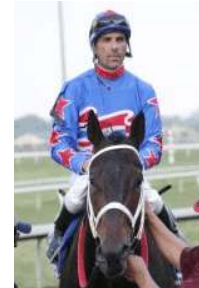
LONE STAR DEPUTY Grand Prairie Turf Challenge S. (4-5)