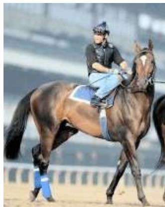
Empire Maker

Hall of Fame trainer Bobby Frankel, still looking for his first Kentucky Derby winner, will saddle the morning-line favorites in Saturday's two major Derby preps. When entries were taken yesterday, Frankel's GI Florida Derby winner Empire Maker (Unbridled) was installed the 3-5 morning-line favorite for the GI Wood Memorial