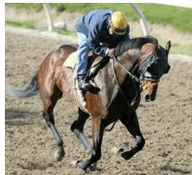
Ministers Wild Cat

Eight three-year-olds are each hoping to earn a last-minute trip to the May 3 GI Kentucky Derby with a big performance in today's GII Coolmore Lexington S. at Keeneland. Ministers Wild Cat