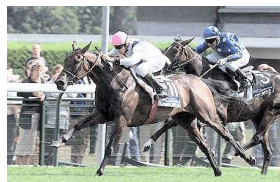
Pearly Shells at Longchamp

PEARLY SHELLS RETIRED One of the best three-year-old fillies in France last year, Pearly Shells (GB) (Efisio {GB}--Piffle {GB}, by Shirley Heights {GB}) suffered a strained tendon in preparing for her seasonal