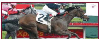
Undeclared 3-year-old FM THE TIGER is prepping for major Canadian stakes.