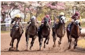
Turning for Home in the Lexington

Can his luck possibly continue? Trainer D. Wayne Lukas won his third GII Coolmore Lexington S. yesterday at Keeneland with Scrimshaw (Gulch), and that Lewis colorbearer could find himself in the starting gate two weeks hence in the GI Kentucky Derby. Lukas' previous two Lexington heroes--Charismatic in 1999 and Proud Citizen last year--went on to distinguish themselves at boxcar odds in the Run for the Roses: Charismatic won at 31-1, while Proud Citizen completed the exacta at 23-1. Scrimshaw hadn't raced since Feb. 15, undergoing throat surgery after a fourth in the GII Hutcheson S. at Gulfstream. But the dark bay had opened his career with promise at Santa Anita, capturing his Nov. 3 debut by two lengths, then defeated Eye Of The Tiger (American Chance) in a swiftly run allowance Dec. 26, earning a 104 Beyer while covering six furlongs in 1:08 1/5. Asked to tackle two turns, he was three wide throughout the GII San Felipe S. Jan. 18, finishing third to Domestic Dispute (Unbridled's Song) as the 9-5 chalk. Scrimshaw broke awkwardly in the Hutcheson and never figured when fourth in a six-horse field, prompting the decision to have a minor throat operation. He posted a bullet half in :46 3/5 at Churchill Wednesday for his return and was sent off as the fourth choice in this field full of Triple Crown nominees.