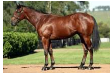
Lot 288

Despite the worries over SARS, there are several entrants in the sale that promise to generate excitement. Lot 511 , a Danehill--Bonanova (Aus) filly from