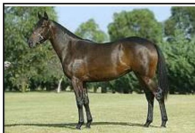
Session-topping lot 335