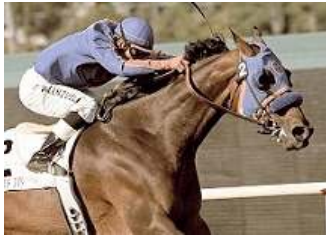
Ladies Din

Ladies Din (Din's Dancer), out of action since taking the GI Shoemaker Breeders' Cup Mile at Hollywood Park 11 months ago, makes his long-awaited return in the GII San Francisco Breeders' Cup Mile at Bay Meadows this afternoon. The eight-year-old gelding, who won this race three years ago, started only once in 2001, running 11th in the G2 Dubai Duty Free H. at Nad al Sheba. He made three starts last season, but was shelved after his