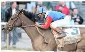
My Boston Gal

Today's 129th renewal of the GI Kentucky Oaks has drawn some of the best three-year-old fillies in training. California-based Elloluv (Gilded Time) suffered two losses to Composure over the winter at Santa Anita, but stepped out of that filly's shadow in wiring her foes in the GI Ashland S. at Keeneland Apr. 5. Finishing her behind her that day were the previously unbeaten Lady Tak (Mutakddim) and Holiday Lady (Deputy Commander). Having drawn the rail, the speedy