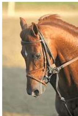
Peace Rules