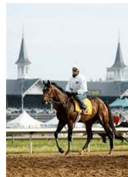
Ten Most Wanted