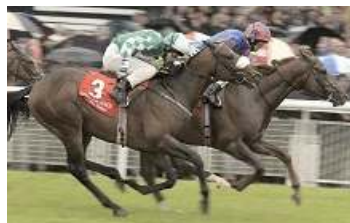
Hold That Tiger (inside)

Trainer Aidan O'Brien, who saddled the one-two last year, will deserve high praise if Hold That Tiger (Storm Cat) or Tomahawk (Seattle Slew) provide him with a third G1 Sagitta 2000 Guineas at Newmarket this afternoon. Both colts already have more miles on the clock