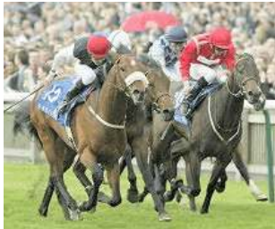
Refuse to Bend (shadow roll) wins 2000 Guineas

Click for the racingpost.co.uk chart or the free brisnet.com catalogue-style pedigree.