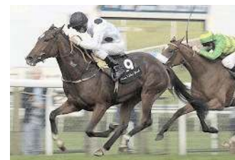
Soviet Song defeats Casual Look

Soviet Song (Ire) (Marju {Ire}) handled soft conditions with aplomb when thrashing Summitville (GB) (Grand Lodge) by three lengths in the Listed Sweet Solera S. on the July course in August. She was impressive again when beating Casual Look (Red Ransom) by 1 1/2 lengths in the G1 Fillies' Mile at Ascot Sept. 29 on faster going and has reportedly been flying on the Newmarket gallops. That has not been the case for Russian Rhythm (Kingmambo), who looked a world-beater when taking the G2 Lowther S. at York in August before finishing runner-up to Airwave (GB) in the G1 Cheveley Park S. at this track in October.