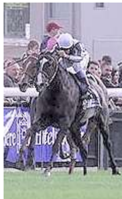
Six Perfections

Six Perfections (Fr) (Celtic Swing {GB}) has a date with destiny at Newmarket this afternoon as she bids to justify favouritism in the G1 Sagitta 1000 Guineas. At least history is on her side, as her dam is a half sister to the brilliant Miesque, who avenged the disqualification of her sire Nureyev in the 2000 Guineas by winning this event in 1987. Six