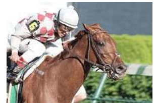
Funny Cide

Hours are spent every year trying to predict which horse will get a good, clean trip in a big Derby field, but few would have predicted that Funny Cide would be the one this year. Breaking cleanly from post six, the chestnut was able to cruise up into third as most of his rivals to his outside began to play bumper cars. Brancusi (Deputy Commander) showed the way early, but began to back out of it heading into the far turn, leaving Peace Rules in front. Funny Cide began to move forward and drew even approaching the stretch as Empire Maker came up on the outside. The favorite looked like he might get by, but the New York-bred showed his grit, battling back and drawing off in the final sixteenth. Derby cont. p2