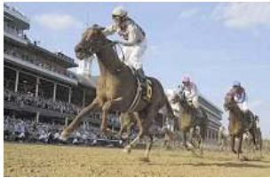
Funny Cide wins Derby

Funny Cide (Distorted Humor) had come up short to both Empire Maker (Unbridled) and Peace Rules (Jules) in his last two starts, but the chestnut struck a blow for his native state yesterday afternoon at Churchill