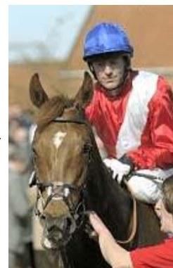
Russian Rhythm