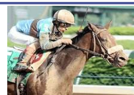
Bird Town Horsephotos