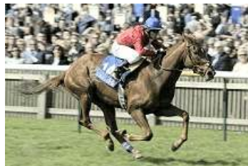
Russian Rhythm Wins Guineas

Russian Rhythm (Kingmambo) was sent off at the remarkable odds of 12-1 due to the negative vibes leading up to yesterday's G1 Sagitta 1000 Guineas at Newmarket, but Cheveley Park Stud's chestnut came good in time to ward off the strong French challenge of Six Perfections (Fr) (Celtic Swing {GB}) and Intercontinental (GB) (Danehill), taking the fillies' Classic by 1 1/2 lengths. In a race that was all about breaks, jockey Kieren Fallon proved he has