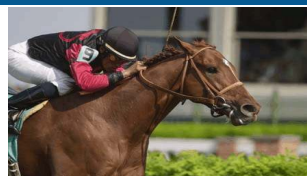
HONOR IN WAR

HONOR IN WAR was sold at Keeneland September by Mill Ridge and is out of a mare by Mill Ridge Stallion DIESIS .