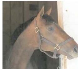
Ten Most Wanted