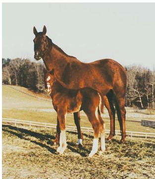
Belle's Good Cide