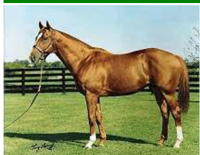
By Blushing Groom , out of Glorious Song