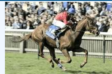
Russian Rhythm

This was KINGMAMBO's 4th Classic Winner, 9th G1 Winner from 7 crops of racing age!