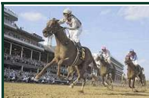
Funny Cide