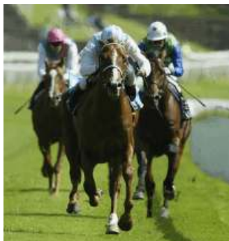
Dutch Gold

Dutch Gold (Lahib) led every step of Tuesday's G3 Victor Chandler Chester Vase, drawing off to win by six lengths. Ninth in the G2 Royal Lodge S. at Ascot on his final juvenile start last September, Dutch Gold showed