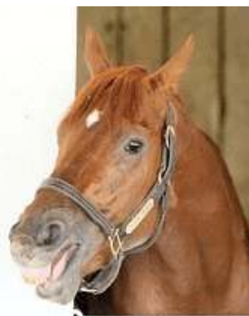
Peace Rules