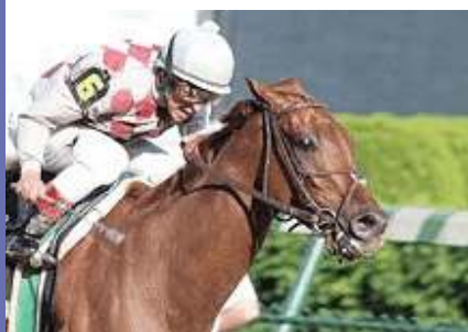
Funny Cide

All horses in the TDN are bred in North America, unless otherwise indicated