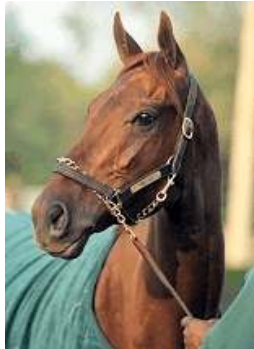
Funny Cide