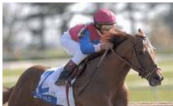
Peace Rules

"He seems to have handled these kind of tracks in the morning," Tagg told The Blood-Horse . "He doesn't seem to mind it. I'm sure it will be muddy or drying out --he'll just have to like it."