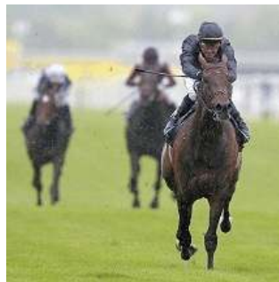
Hawk Wing

Hawk Wing (Woodman), described by Aidan O'Brien as "a horse that would always quicken up your heart," put on a heart-stopping performance yesterday. The four-year-old made all to outclass the best milers in Europe in the G1 Juddmonte Lockinge S. at Newbury by an incredible record 11 lengths. Despite the persistent rainfall, a headwind and the withdrawal at the start of a guaranteed lead from Desert Deer (GB) (Cadeaux Genereux {GB}), his time of 1:36.78 was just over the record. "Some guys are going to have to eat a lot of humble pie," an ebullient jockey Mick Kinane said.