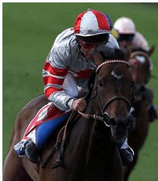
Millenary

The older generation will be featured this afternoon at Saint-Cloud in the G2 Prix Jean de Chaudenay - Grand Prix du Printemps. Hero of the G1 St Leger in 2000,