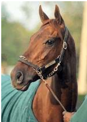
Funny Cide