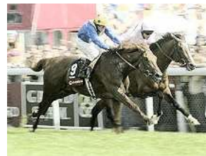
Kris Kin (outside) wins Derby

Sir Michael Stoute credited the public support that saw Kris Kin (Kris S.) sent off at 6-1 in yesterday's G1 Vodafone Derby to the "Fallon factor," and the jockey justified the people's faith. Kieren Fallon drove Kris Kin past The Great Gatsby (Ire) (Sadler's Wells) in the final quarter to win the Epsom Classic by a length. "I think he got one of the great rides around Epsom on Derby day from Kieren Fallon," Stoute said of his third Blue Riband hero and first since Shahrastani in 1986. Placed in a perfect stalking position on the inner as The Great Gatsby cut