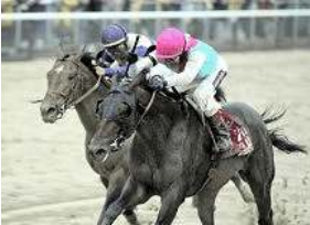
Empire Maker (pink cap)