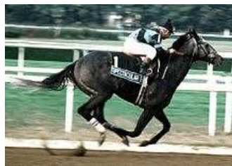
Spectacular Bid

The last great racehorse of the halcyon '70s, Spectacular Bid (Bold Bidder--Spectacular, by Promised Land) died Monday afternoon at Milfer Farm in Unadilla, New York. The cause of death is believed to be a heart attack; the 27-year-old stallion will be buried at the farm.