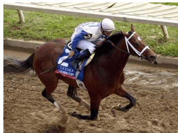
Proud Citizen winning the 2002 Coolmore Lexington

With good reason, GI Pimlico Special winner Mineshaft (A.P. Indy) and GI Met Mile hero Aldebaran (Mr. Prospector) will receive the bulk of the attention