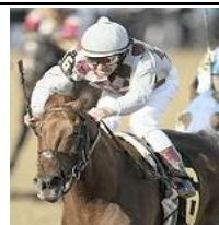
Funny Cide