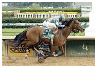
Perfect Drift (#9) Takes

Mineshaft (A.P. Indy) gave it his all, but Perfect Drift (Dynaformer) proved narrowly better, winning the GI