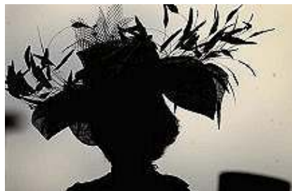
Royal Ascot racegoer