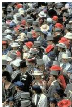
Royal Ascot crowd

Nearly three centuries after Queen Anne recognised the potential of the area of open heath close to Windsor