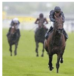
Hawk Wing

The presence of Hawk Wing (Woodman) should justify the decision to elevate the Queen Anne S. to Group 1 status for the first time today at Royal Ascot. After