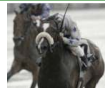
IRON DEPUTY wins Brooklyn H. (G2)

2nd-LEADING SIRE of SWS (9) and GSWS (4)