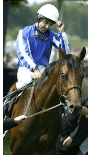
Zafeen