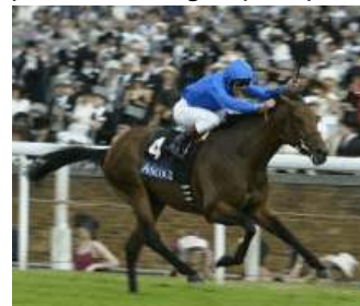
Dubai Destination

All the pre-race hype focused firmly on the 8-13 favorite Hawk Wing (Woodman), but it was the 9-2 second choice Dubai Destination (Kingmambo) who powered to glory to provide Godolphin with their fifth renewal of the G1 Queen Anne S. at Royal Ascot yesterday. Settled in mid-division by jockey Frankie Dettori throughout the early stages as the stable's rabbit Blatant (GB) (Machiavellian) dictated the tempo, he traveled alongside Hawk Wing until leaving that rival behind inside the final three furlongs. Showing the same acceleration that took him past Rock of Gibraltar (Ire) as a juvenile, he hit the front with 400 yards remaining before powering clear of Tillerman (GB) (In the Wings {GB}) and the Queen's Right Approach (GB) (Machiavellian). "Today I knew I had a good horse to give Hawk Wing a race," Dettori explained. Cont. p. 2