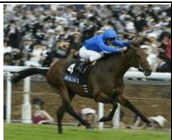
Dubai Destination

Congratulations to all and best of luck in the future!!