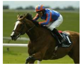
Black Sam Bellamy

Mr Dinos (Ire) (Desert King {Ire}), who represents the new blood among this division, bids to cement his position as leading stayer in today's G1 Gold Cup at Royal Ascot. He laid claim to that title when winning the G2 Bonusprint Henry II S. at Sandown last time May 26, where Pole Star (GB) (Polar Falcon), Kasthari (Ire) (Vettori {Ire}) and Persian Punch (Ire) (Persian Heights {GB}) were second, third and fourth, respectively. Last year, the four-year-old progressed throughout his sophomore campaign, finishing a half-length runner-up to today's arch-rival Mamool (Ire) (In the Wings {GB}) in the G3 Queen's Vase on this day before winning the G3 Prix Berteux at Vichy the following month. He again finished behind Mamool when they were fourth and fifth in the G1 St Leger at Doncaster in September but bounced back to take the G1 Prix