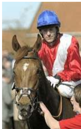
Russian Rhythm

Russian Rhythm (Kingmambo) bids to become the first filly since One in a Million (GB) in 1979 to follow up success in the G1 1000 Guineas with Royal Ascot glory in today's G1 Coronation S. That daunting statistic is the only thing to dent enthusiasm, but it is hard to imagine anything but the Cheveley Park livery being carried to victory in this contest. Russian Rhythm made an immediate impact at two, winning a Newmarket