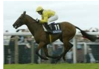
Mr Dinos

Kieren Fallon, riding 3-1 second favorite Mr Dinos (Ire) (Desert King {Ire}), made yesterday's G1 Gold Cup at Royal Ascot a war of attrition and duly annihilated a class field to win the 2 1/2-mile event by six lengths. Stalking the veteran Persian Punch (Ire) (Persian Heights {GB}) throughout the contest, the champion jockey asked his mount to stretch inside the final mile and he responded to catch the old-timer on the turn into the straight. Pulling further clear with distance, he was never in danger as Persian Punch gamely clutched to the runner's-up honors on his seventh attempt at this marathon.