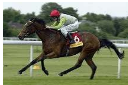
Golden Jubilee favorite Airwave winning at Sandown

With a huge field of 22 assembled for today's G1 Golden Jubilee S. at Royal Ascot, jockey Dane O'Neill faces the task of threading Airwave (GB) (Air Express {Ire}) through the eye of a needle. The three-year-old filly is a brilliant sprinter, as she proved when beating Russian Rhythm in the G1 Cheveley Park S. at Newmarket in October and when defying a penalty to