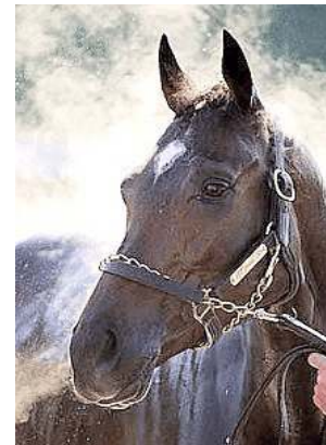
Take Charge Lady

Saturday, Belmont Park, post time: 5:12 p.m. EDT OGDEN PHIPPS H.-G1, $300,000, 3yo/up, f/m, 1 1/16m