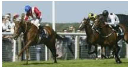
Russian Rhythm outprints Soviet Song (black cap) in the Coronation

Russian Rhythm (Kingmambo) used her "raw power" to break the hoodoo of 1000 Guineas winners in the G1 Coronation S. at Royal Ascot, beating arch-rival Soviet Song (Ire) (Marju {Ire}) by 1 1/2 lengths as the 4-7