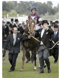
Choisir

Choisir (Aus) (Danehill Dancer {Ire}) put the finishing touches on the story of the week at Royal Ascot yesterday, adding the G1 Golden Jubilee S. to his victory in Tuesday's G2 King's Stand S. Australia's new equine hero set up this tantalizing prospect when beating Acclamation (GB) by a length from a low draw in Tuesday's five-furlong dash, but was drawn wide in the 20 hole over this stiffer six. Choisir broke fastest of all, and jockey Johnny Murtagh poached enough of an advantage to creep the 13-2 second choice across to the stands' rail inside the final quarter.