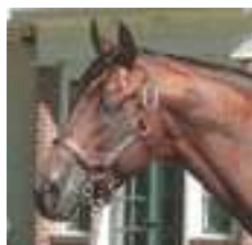
LEMON DROP KID

Watch for the first yearlings by Grade 1 Winners