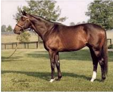
Chester House Juddmonte.com