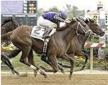
Belong to Sea (rail) beats Chimichurri

There will be seven graded stakes across the nation on Independence Day, headlined by the GI Prioress S. at Belmont Park. The $200,000 sprint will feature a rematch between unbeaten Belong to Sea (Belong to Me) and Chimichurri (Elusive Quality), who finished heads apart in the GIII Miss Preakness S. May 15. Met Mile hero Aldebaran (Mr. Prospector) stars in the seven-furlong GII Tom Fool H., while three of his stablemates-- Lilac Queen