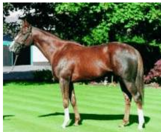
Giant's Causeway