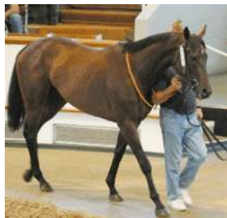
Littleton Arwen