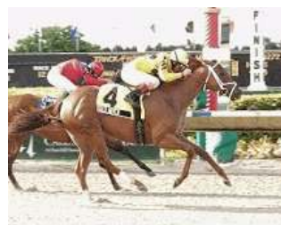
Gold Mover at Calder in 2002

Calder Race Course will host its fourth annual Summit of Speed Saturday afternoon when four graded stakes worth $1.6 million will be contested. In 2003, Orientate won the GIII Smile Sprint H. on his way to the Eclipse Award as the nation's top sprinter, while 2001 champion three-year-old filly Xtra Heat ran second to Gold Mover (Gold Fever) in the GII Princess Rooney H.