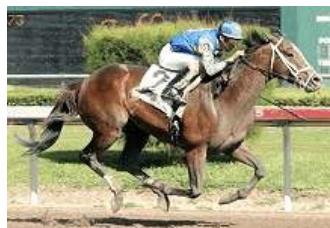
Harlan's Holiday