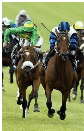
Vintage Tipple (right)