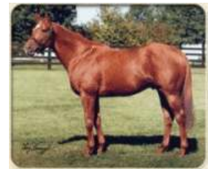
Golden Missile