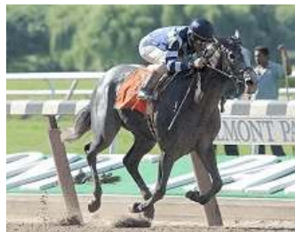
Spoken Fur

Two down, one to go. Spoken Fur (Notebook) moved one race closer to a $2 million bonus yesterday, cruising to a decisive 3 1/2-length victory in the second leg of New York's new Triple Tiara, the GI Coaching Club American Oaks at Belmont Park. In the process, the gray gave trainer Bobby Frankel his sixth Grade I win at the Belmont meet. There have been nine Grade I events at the meeting, but Frankel has had runners in only seven of them. The Hall of Fame horseman believes the Triple Tiara bonus is all but in the bag. The final race in the series is the GI Alabama S. at Saratoga Aug. 16. "She won so big in the Mother Goose and she's really come on since the last race. If she runs like she has in the last two races, she should be very tough to beat," he said. CCAO cont. p2